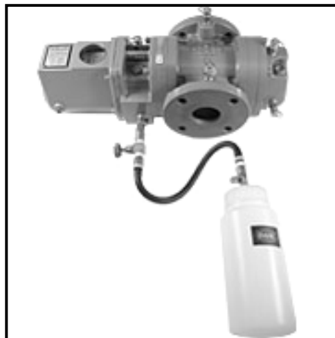
Model 1650 Drainage Assembly

When used in unison the Model 1600 Oiler and the Model 1650 drainage system allow for an environmentally friendly, quick and easy meter oil replacement system.