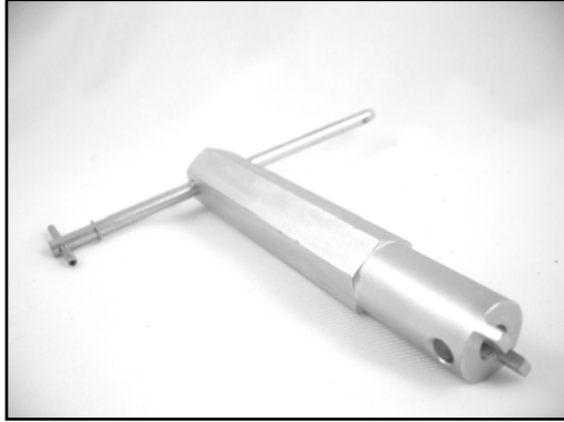
WR201-0001-U Universal Regulator spring adjustment tool

Specially manufactured for B-42, B31, B34, B38, B35, B36, B56 series Actaris pressure regulators. *Handle is removable for use on both sides of tool*