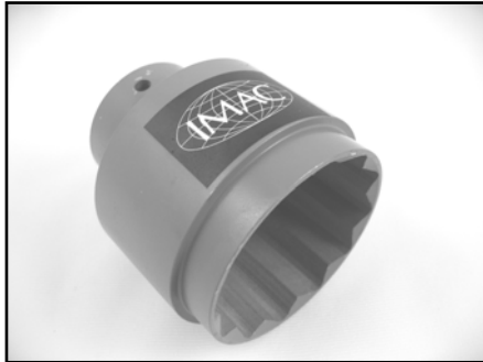
SW202-2 2 1/4" Hex Machined Socket 3/4" Drive

Specially manufactured with thin wall for B / CL37 / 838 series Actaris Pressure Regulator Orifices