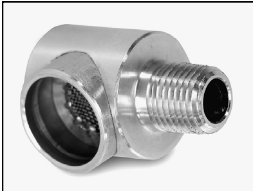
RV-706-25DR Aluminum Vent 1/4", 1/2", 3/8" NPT *other sizes available upon request

Specially manufactured for adapting a 10" (Actaris) face to face flanged valve body into a space for a larger, 10.5" face to face flanged valve body