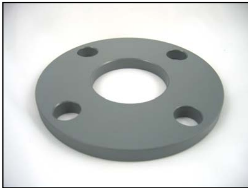
FS206-20-1 Regulator Flange Spacer 7/16" Thick, 2" IPS

Specially manufactured for B-42, B31, B34, B38, B35, B36, B56 series Actaris pressure regulators. *Handle is removable for use on both sides of tool*