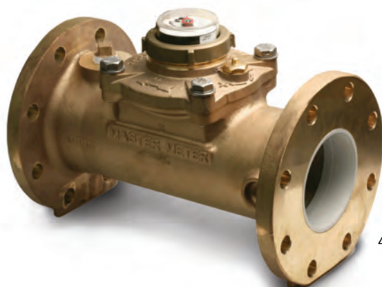
4" MMT pictured