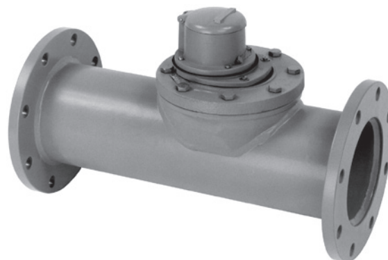
6" Model 101 Propeller Meter

Registers: Sensus Model 101 Propeller Meters come equipped with a sealed direct reading (DR) register with low flow indicator. The Model 102 is equipped with an electronic rate of flow indicator (E-ROFI) register. The E-ROFI register is an hermetically sealed unit that electronically displays and transmits totalization and flow rate data to various Sensus act-pak instrumentation to monitor, control and record volume and rate of flow. Other register options available are the impulse contactor (IC) and high speed pickup (HSP).