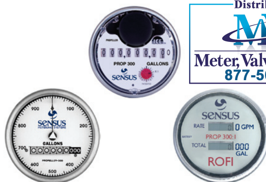
Standard Sealed Register