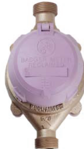
Meter with local register