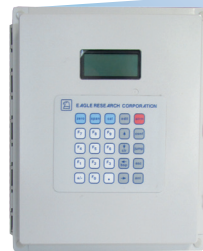
Optional Redundancy Available

Recognizing that the needs of our customers may sometimes require more than our standard product offerings, UL certified panels are available for design to aide in meeting these needs. This permits working with the customer from conception through installation and start up to insure that all requirements are met. Flexible RTU programming using a database process concept of configurations can address even the most sophisticated applications. Use of the expanded architecture of the XA32/5™ or E-Series™ processor platforms provides the ability to terminate numerous analog and digital I/O points in a single location for processing. The keypad and display allows the customer to easily and quickly update configuration and other set-point information locally at the RTU.